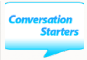
"I'm inspired when..."