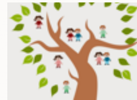
My People Tree

A few engaging activities that you could try are the My People Tree and Conversation Starters. The My People Tree is when the mentor and mentee draw trees with each branch representing an important person in their life and then describing why they are important. Conversation Starters can range from "I feel proud when...", "I'm happiest when...", the funniest thing I ever saw was..."